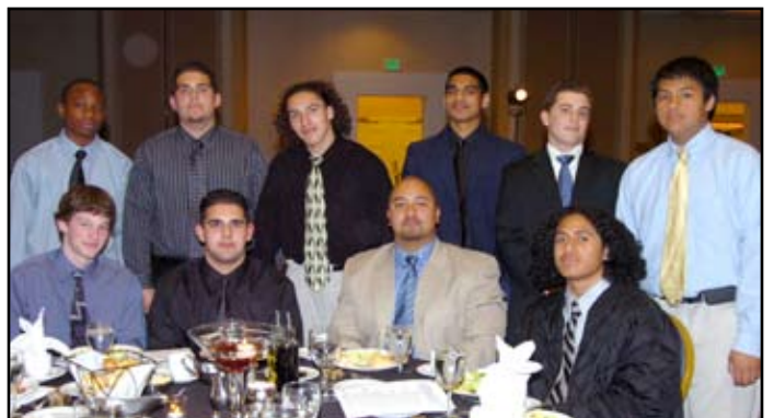
South San Francisco HS Play It Smart Participants.